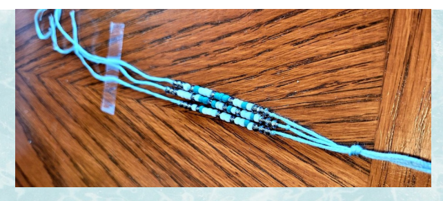
Continued on back

Step Five: If you are planning to wear multiple bracelets at one time, complete steps 1-4 for each bracelet. Then, lay in order and tie bracelets together with a single knot on each end. This will make it easier to tie to your wrist.