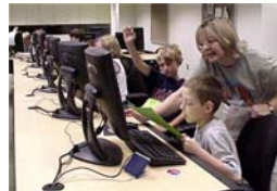
An Internet scavenger hunt.