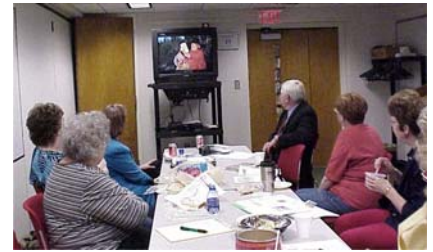
While enjoying a brown bag lunch, participants viewed excerpts from "Colonial House" and shared their reactions to the six-hour PBS series.