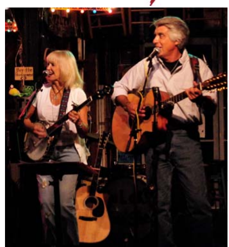
A family concert, "Singing the Good Old Songs Again," will wrap up all events July 29.