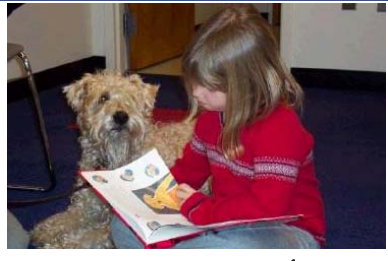
Sharing a favorite book with a new friend

See next month's newsletter for pictures and news of the February 28 event. Because of the enthusiastic response to this new concept, the Foundation hopes it becomes a tradition. Whodunit? By now we all know!