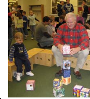
Snow Ball 2008